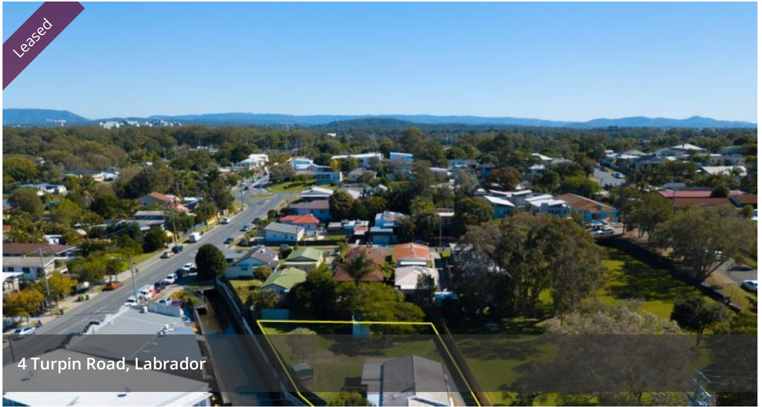
4 Turpin Road, Labrador