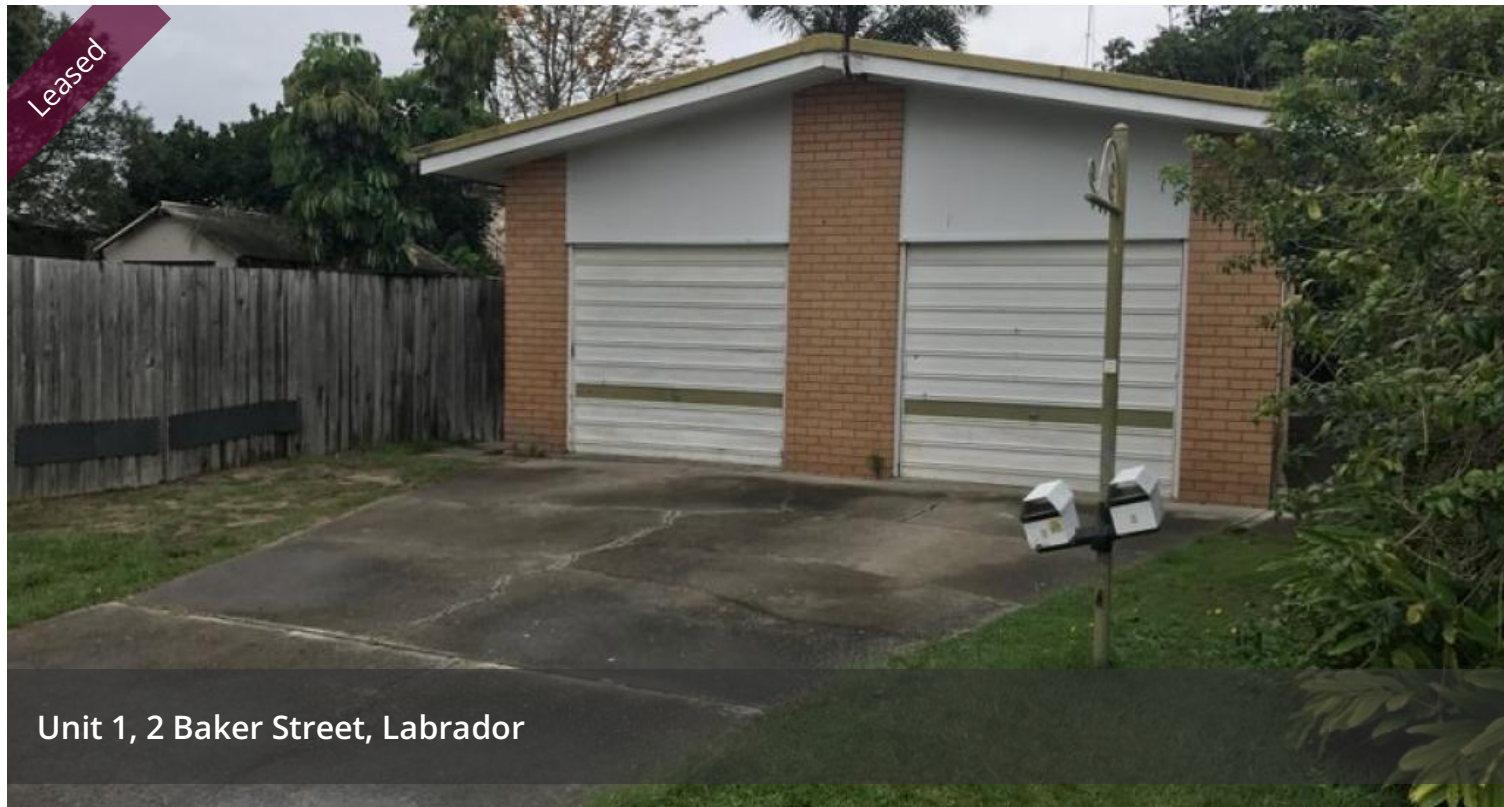
Unit 1, 2 Baker Street, Labrador